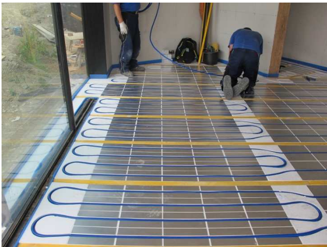
Shot showing the JUPITER IDEAL EP0 installed between 30mm softwood battens.