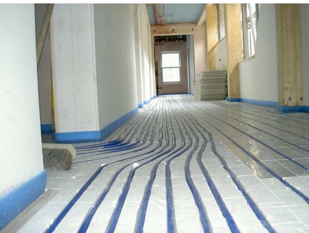
Shot showing flow and return pipework lying next to normal heating panels in long corridor.