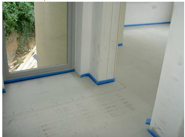
20mm Fermacell 2E11 installed as load bearing surface in carpeted bedrooms.